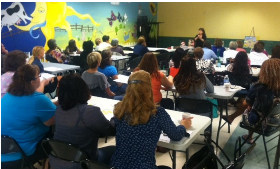
Photo below from recent District 5 training event held on October 11, 2014.